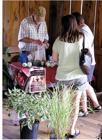
Shoppers look over the offerings of Market vendor Windover Farms

(grass-fed, Piedmontese beef and alpaca wool), Honeycutt Nursery (annuals and perennials), B & R Greenhouse (perennials and produce), Hunter Farms (blueberries and handmade soaps), Windover Farms (perennials, berries and produce) and Rick Walker Farms (hydroponic tomatoes and cucumbers) with more to come in the following weeks.