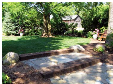
Stone steps and a newly-leveled lawn provide an attractive multi-purpose area (see also yoga picture on page 2).