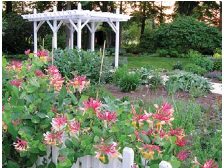
A beautiful new arbor welcomes visitors into the Gardens.

If you haven't visited the Gardens yet this season, you've missed all the wonderful changes that have taken place! Here are just a few: