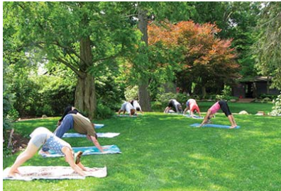
YMCA Yoga class doing their best "Downward Dog"

This season has found Goodell Gardens forming partnerships with many other community organizations. Our newest connection began on the Summer Solstice, June 20, as we be-