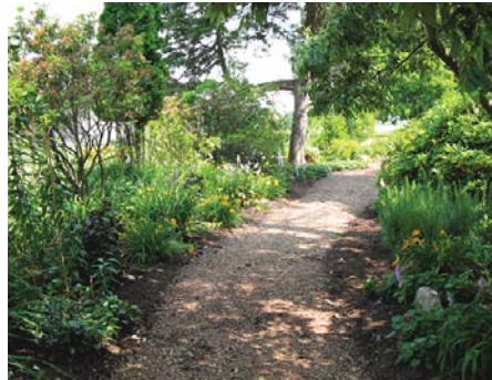
New, and improved, pathways create a nice flow through the Gardens.