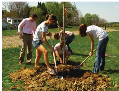
Students help plant Sugar Maples on Arbor Day

This April's Arbor Day saw a new addition to our cooperative efforts. For the first time, our annual Arbor Day Tree Planting included General McLane High School students involved