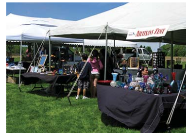
The Artist Tent was a welcome addition to the Edinboro Art & Music Festival

A local alliance that continued to grow this season was one with the Edinboro Art & Music Festival in mid-May. In this second year of collaboration, Goodell Gardens hosted an Artist Tent which held ten regional artists in