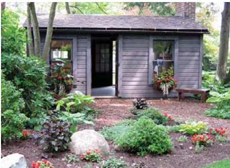
Carrie's Cabin now has a lovely "front" entrance, complete with new plantings, flower boxes and bench.