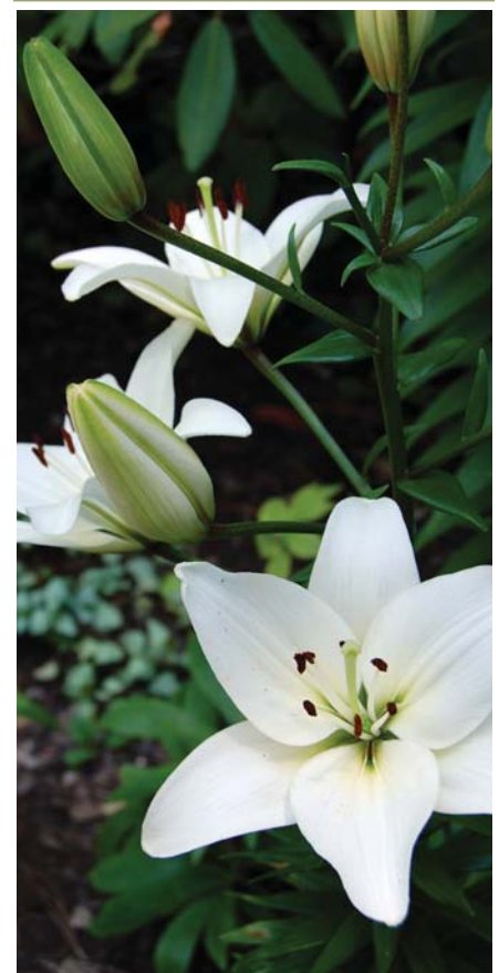
The Casa Blanca Lillies, (Lilium 'Casa blanca') at Goodell Gardens were recently transplanted to the sunken garden, near the Japanese Maple. These beautiful white lillies have a lovely fragrance and large blooms. Be sure to seek them out if you stop by in the coming weeks.